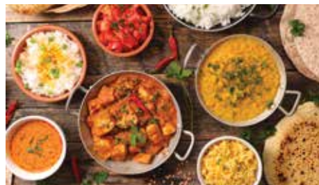
Healthy & hygienic Indian food