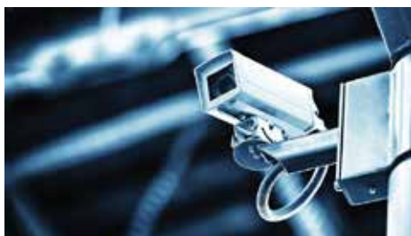
100% safety and security