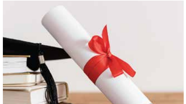
Doctorate in Medicine