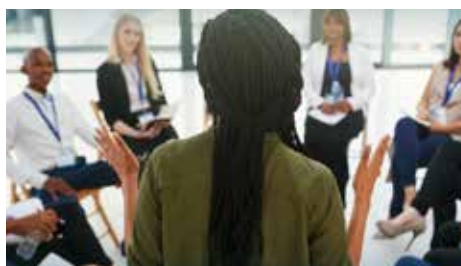
Outstanding academics and professional training