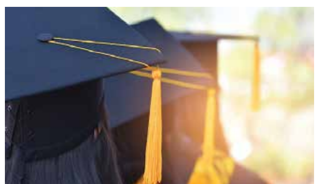
Bachelor's program in Medical Rehabilitation and Nursing care