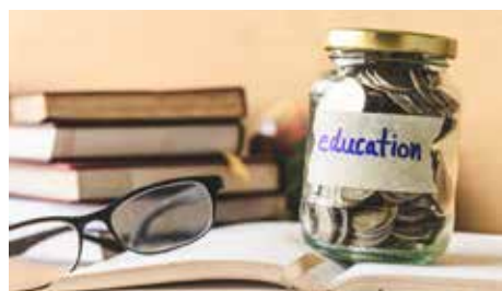
Affordable tuition fees