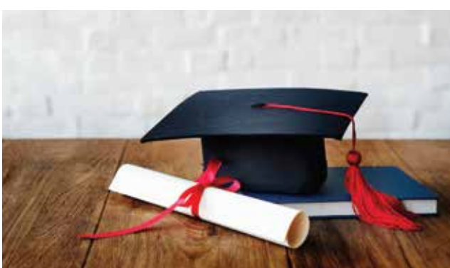
Medical Doctor Program (MD)

NVU aims to offer an integrated and multi-disciplinary education that is mediated through research, education, and innovation. The New Vision University School of Medicine offers four-degree programs namely: