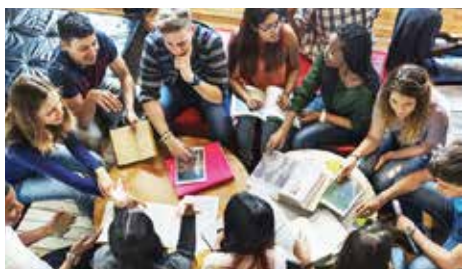
Exceptional resources and facilities