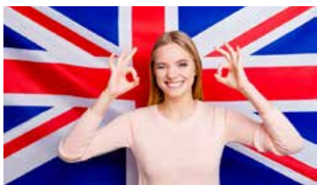
Complete English taught programs