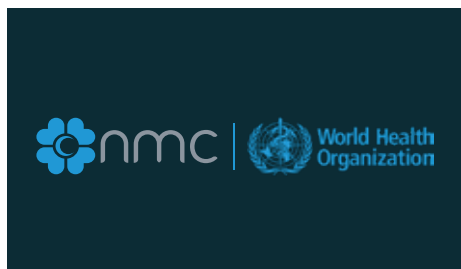
NMC & WHO approved