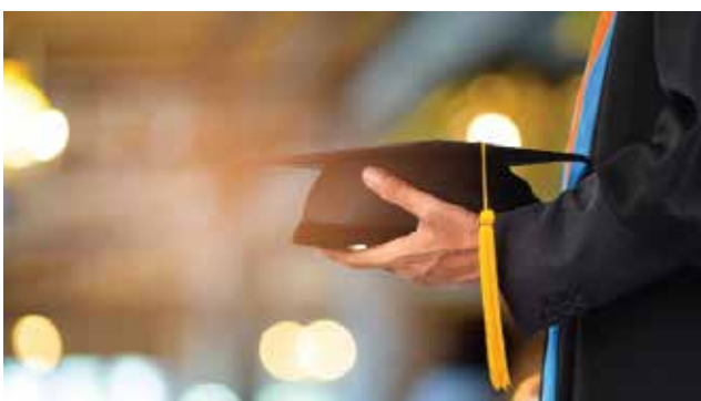
Master's Program in Medical Rehabilitation and Healthcare Management